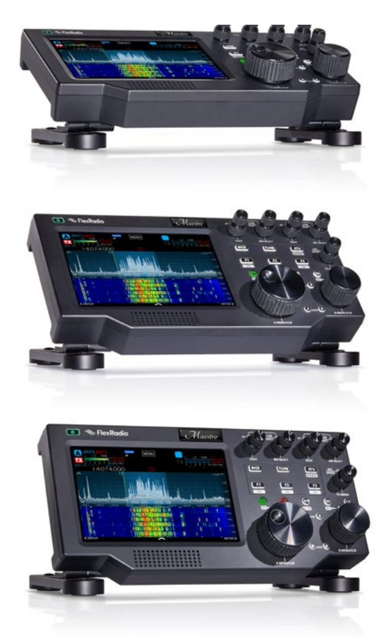
Maestro shown with special Tilt Hinge Feet. Not Included